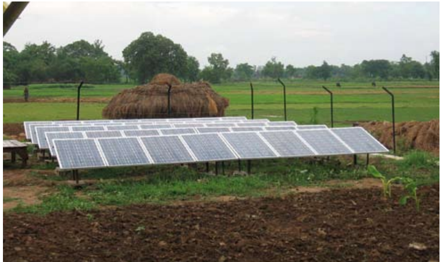
In remote locations, solar energy is the power source of choice. Due to difficult roads, fuel logistics for diesel generators can be a real challenge.

Systems can be optimized to provide all desired functions with the existing system components, requiring no additional parts. The system offers individ-