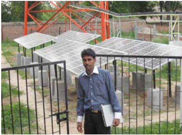
In India, telecommunication sites are generally built and operated by state-owned enterprises.

make it virtually impossible to provide regular service or fuel to the systems. In addition, diesel is a limited energy resource compared to solar and wind power. In the past, the systems were not supported by remote monitoring. Therefore, operators were often not informed about on-site bottlenecks in time, which led to inconvenient downtimes, requiring immediate trips to the location.